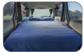
Large comfy double bed