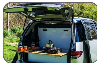
Undercover cooking area